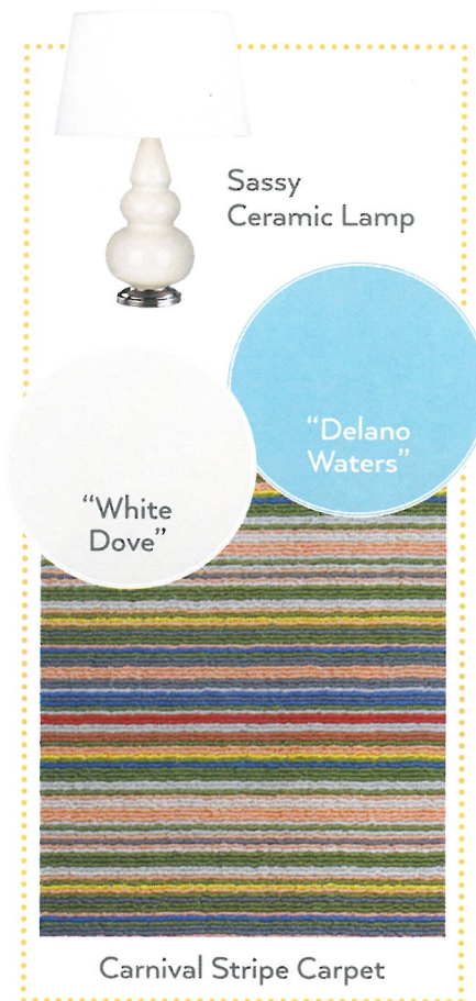
Carnival Stripe Carpet